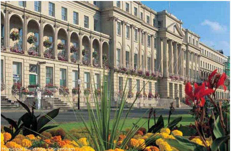
Municipal Buildings, Cheltenham

Please note: Students paying by instalments must open a bank account as soon as they arrive in the UK and provide the Tuition Fee Administrator intfeesadmin@glos.ac.uk with full account details by 7 October at the latest. You will receive the necessary documentation and help to open a bank account during the Welcome Week.