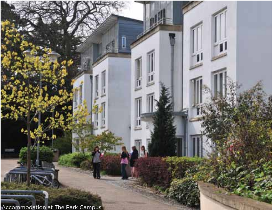
Accommodation at The Park Campus

If you have not yet found accommodation, we strongly advise you to book a place on our House Hunting Event on Monday 12 September. During this event you will be given access to the university's list of registered housing in the private sector and there will be lots of help to phone landlords and look at properties. There will be plenty of time to meet potential flatmates on Sunday 11 September if you don't know anyone. You can also join our group on Facebook at www.facebook.com/uniofglosint for extra networking before you come. To book a place on the House Hunting Event, please email internationalstudents@glos.ac.uk .